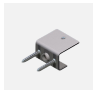
WB-SS20 Wall bracket