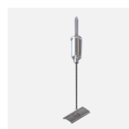
SWK-1-1M / SWK-1-2M / SWK-1-4M Wire suspension