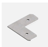
JN-90-12 90 degree joiner