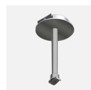
SRK-1-S / SRK-1-W / SRK-1-B Rod suspension kit (rod not incl.)