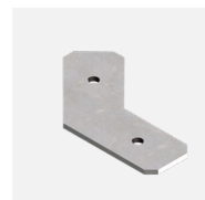
JN-135-12 135 degree joiner