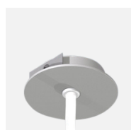
CB-60-R-S / CB-60-R-W / CB-60-R-B Cable base 60, recessed