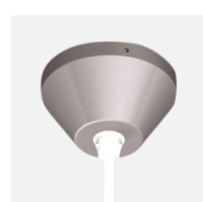
CB-80-SM-S / CB-80-SM-W / CB-80-SM-B Cable base 80, surface mount