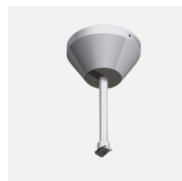
SRK-6-S / SRK-6-W / SRK-6-B Rod suspension kit (rod not incl.)