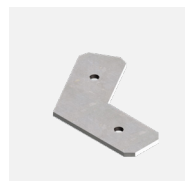
JN-120-12 120 degree joiner