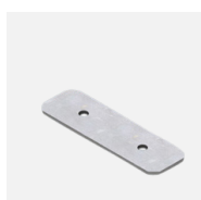
JN-ST-12 Straight joiner