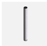
ROD-0.5M | ROD-1M | ROD-2M Suspension rod - 0.5m | 1m | 2m